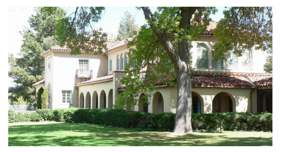
The Villa Philmonte, at Philmont, was Waite Phillips' summer home. It is located across the road from Camping Headquarters. Have your Ranger help schedule a tour and earn the Villa patch while you are in Base Camp.

<u>Search</u>: Having trouble finding information on a particular topic? You can search for it by keyword(s).